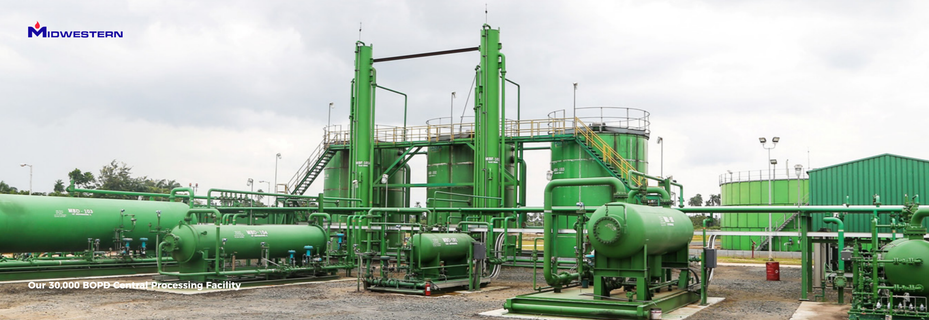
Our 30,000 BOPD Central Processing Facility