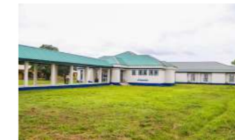
Built, Furnished and Commissioned Amenity Ward at Kwale, Delta State

In line with globally recognized standard, we have implemented CSR initiatives in the following areas of education, healthcare delivery, electricity, infrastructural development, economic empowerment and youth development. Projects implemented include construction of roads, boreholes, community buildings, classroom blocks and a fully furnished 20-bed amenity ward. In addition, we have executed power related projects and in support of culture, we have implemented the Owesse Lake re-channelization project to revive an abandoned fishing festival.