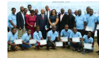
Graduands of Skill Acquisition Programme